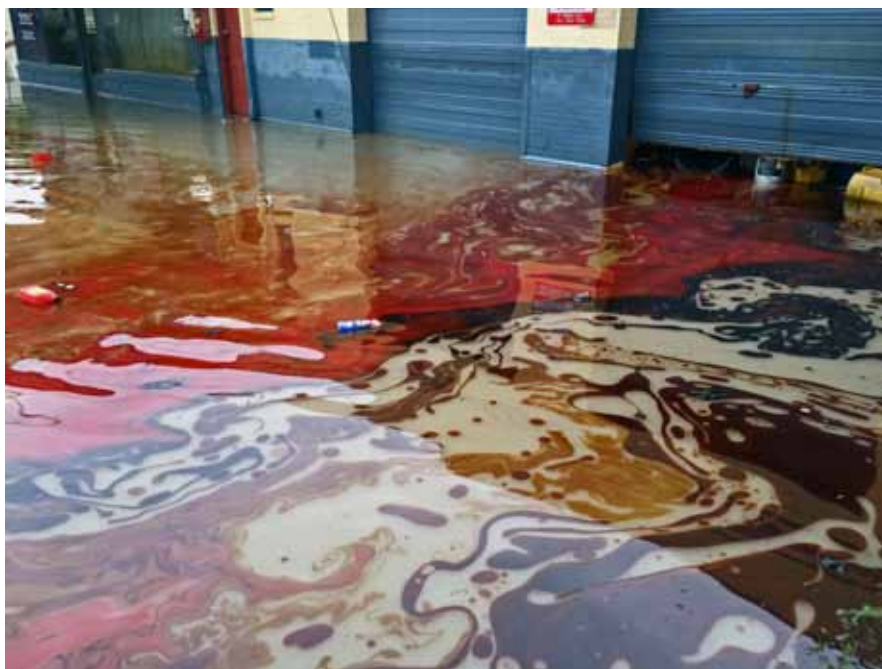
Stormwater mixed with automotive fluids at a service station during the 2015 Memorial Day flood in Austin.

In recent years, Texas has been particularly impacted by flooding. In 2015, 48 people across the state were killed by floods, and Texas has been the state with the highest number of flooding-related deaths 11 times in the last 21 years. 11 (Figure 1.) Damages from flooding totaled more than $3 billion in Texas in 2015, the most expensive year on record. 12