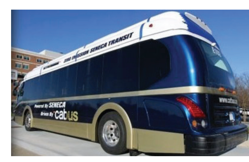
A CAT electric bus.

In 2010, the City of Seneca partnered with CAT, the Center for Transportation and Environment (CTE) and the South Carolina Department of Transportation (SCDOT) to apply for a federal grant from the Low or No Emission Program to develop the first scalable model of an all-electric bus transit system in the U.S. In contrast to other cities, which had to that point only deployed one or two electric buses as "parade buses" in their fleets, Seneca intended from the start to convert the entire operation to all-electric