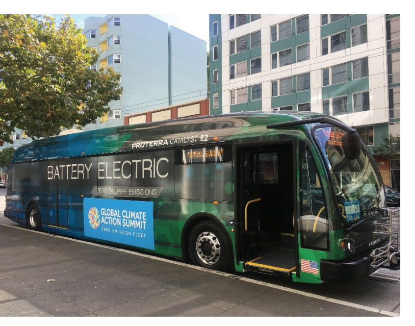
A Proterra electric bus.

Diesel buses also contribute to widespread problems with particulate matter and ozone "smog" pollution across the country. Diesel vehicles produce fine particulates (referred to as PM_{25} ) as well as volatile organic compounds (VOCs) and nitrogen oxides (which are both precursors of ground-level ozone), among other pollutants.<sup>26</sup> A 2017 study linked exposure to fine particulate matter and ground-level ozone to higher rates of mortality, concluding that exposure to particulate matter and ozone, even at levels below national standards, contributes to adverse health impacts.<sup>27</sup> Ultrafine particulate matter (< 0.1 micron in diameter) is especially dangerous since it can enter deep into lower airways, carrying heavy metals that are now linked to Alzheimer's disease, along with odorless, toxic chemicals such as polycyclic aromatic hydrocarbons (PAHs) that irritate the respiratory tract.<sup>28</sup>