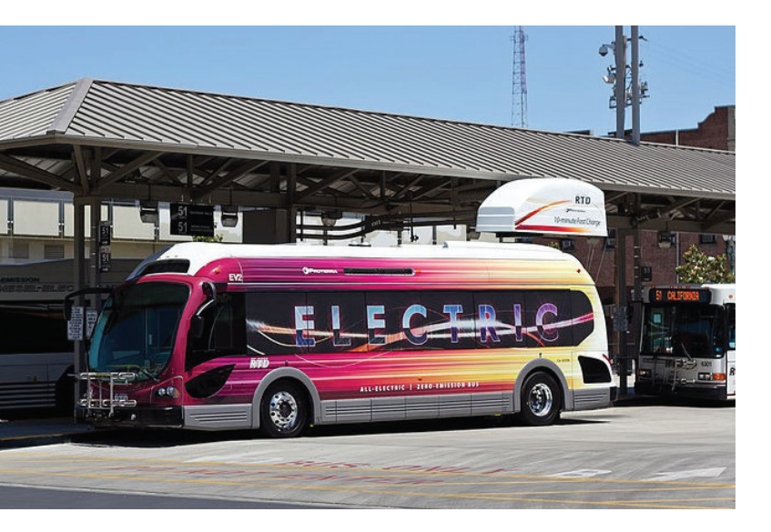
An all-electric Proterra BE35 bus operated by San Joaquin Regional Transit District (RTD), California next to its "Fast Charging" station.

A six-vehicle electric school bus pilot program in California in 2016 concluded that while upfront costs for an electric school bus are much higher than for a diesel equivalent, reduced operating costs more than make up the difference.<sup>50</sup> The study found