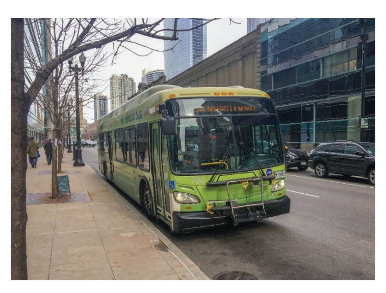
An electric bus in Chicago.

The CTA has committed to converting its entire bus fleet to electricity by 2040,<sup>117</sup> and has claimed that its experience with electric buses has demonstrated that these vehicles are a viable way of building a "greener, healthier and more efficient" transit system.<sup>118</sup>