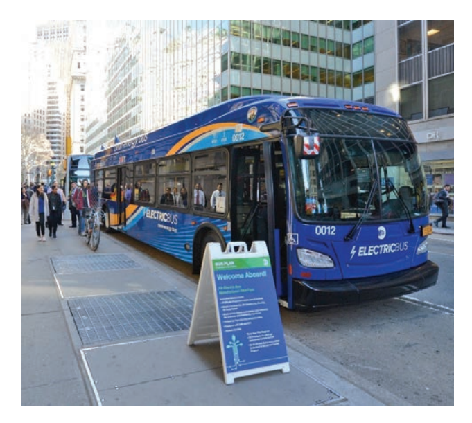
New Flyer electric bus outside MTA Headquarters, New York City, April 2018.