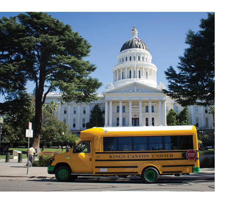
The first all-electric school bus in California, outside the California capitol building in Sacramento in 2014.

of the state's school buses with electric ones by 2040.<sup>85</sup> In 2017 the Sacramento Air Quality Management District awarded funding to 15 school districts for electric bus purchases, and pilot programs have been launched across the state.<sup>86</sup> In 2015, three school districts in Massachusetts launched a pilot project with a total of three electric