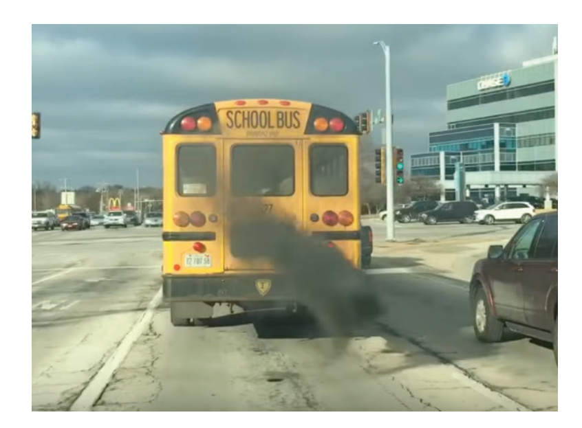
Pollution from a diesel-powered school bus.

Diesel pollution can lead to decreased lung function, respiratory tract inflammation and irritation, and aggravated asthma symptoms.<sup>23</sup> Diesel soot also contains tiny particles of carbon, metal oxides and heavy