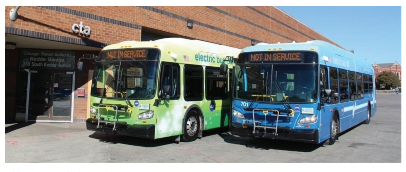
Chicago's first all-electric buses.