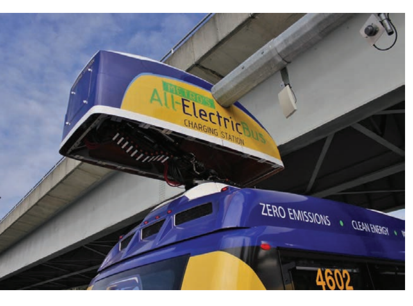
A King County Metro electric bus charging at Eastgate Park & Ride.