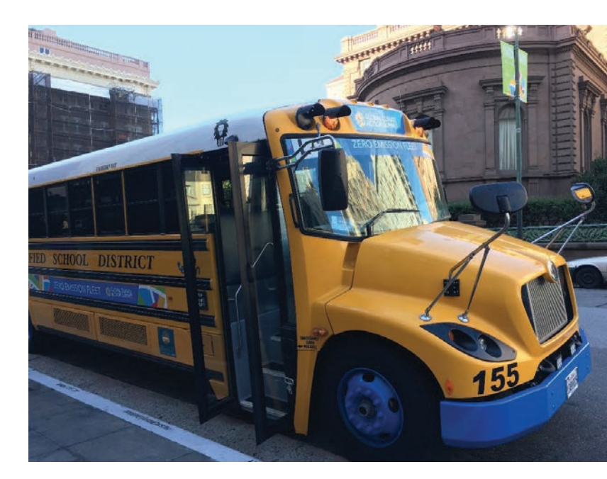
A Twin Rivers USD e-Lion bus.

The rollout of the Trans Tech buses was rockier, Shannon reports. These vehicles are powered by sodium-nickel batteries, which, if they go cold, take two days to warm up to the point where they are functional again. One issue the district encountered was a problem (which the manufacturers now believe they have solved) with the 12 volt battery that keeps the nickel batteries warm. It also emerged that use of the onboard heaters creates a slight drain on the systems, which again, the manufacturers are currently working to address. The district is also working to solve a problem with equipment that manages overnight charging, instead charging the vehicles on-demand for the time being. Energy costs are already low (0.10 per kW/h), but will be reduced further once the managed charging infrastructure is in place.<sup>171</sup>