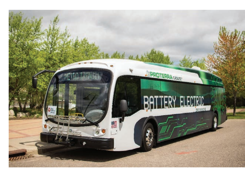
A Minneapolis St. Paul Metro Transit electric bus.

An important driver of electric bus adoption came in the form of the Volkswagen "Dieselgate" settlement, which resulted from VW's deliberate violation of clean air standards. This settlement has made available billions of dollars for states to invest in zeroemission transportation, including electric buses. New Jersey has allocated a portion of its VW award for the acquisition of eight electric transit buses.<sup>81</sup> In Colorado, VW settlement money has funded 24 electric buses across four transit agencies.<sup>82</sup> Following a rollout of three electric buses in 2017 in Howard County, Maryland, the Maryland Transit Administration is planning to spend a portion of the state's VW settlement award on replacing diesel transit buses with electric buses and implementing an electric school bus pilot.83