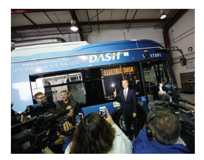
Los Angeles Mayor Eric Garcetti unveils a new 100% electric DASH bus.

California has been at the forefront of moves towards bus electrification. In 2018, the California Air Resources Board approved a statewide rule committing to shift to 100 percent all-electric transit buses by 2040.<sup>71</sup> Large transit agencies in the state will be required to purchase 25 percent electric buses starting in 2023, then 50 percent by 2026, with no new purchases of nonelectric buses beginning in 2029.<sup>72</sup> In 2017 the Los Angeles Department of Transportation (LADOT) and Los Angeles County Metropolitan Transportation Authority (LA Metro) committed to full-fleet electrification by 2030.73 As of 2019, California has 210 electric buses in service and a backlog on order, bringing its total commitment to electric buses to around 450.74