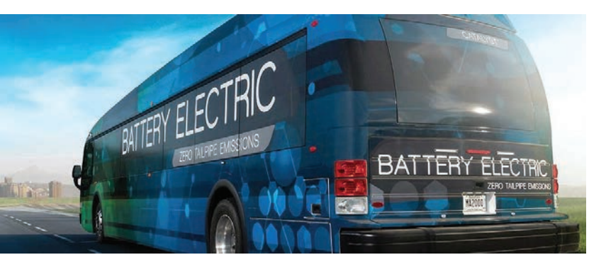
A Proterra Catalyst electric bus.

THE ELECTRIC BUS MARKET in the United States has expanded dramatically over the last five years. There are a total of 528 fully electric, battery-driven buses currently in service across the country - an increase of 29 percent in 2018 alone.<sup>66</sup> Recent pledges by California, New York City and Seattle to transition to zero-emission fleets mean that 33 percent of all transit buses in the U.S. are now committed to go electric by 2045.<sup>67</sup> Roughly 4 percent of all new public transit bus sales in 2018 were electric buses, and 13 percent of the country's transit agencies currently either have electric buses in their fleets or have them on order.<sup>68</sup> Taking into account those that have received grant funding for electric buses but not yet placed orders, upwards of 18 percent of U.S. transit agencies are now making moves toward electric buses.<sup>69</sup> Major players in the market include manufacturers Proterra, BYD Motors and NFI Group, the parent company of New Flyer of America. Companies bringing out electric school bus models include Blue Bird Corporation, Nova Bus Corporation, The Lion Electric Co., Thomas Built